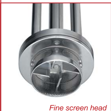
Fine screen head